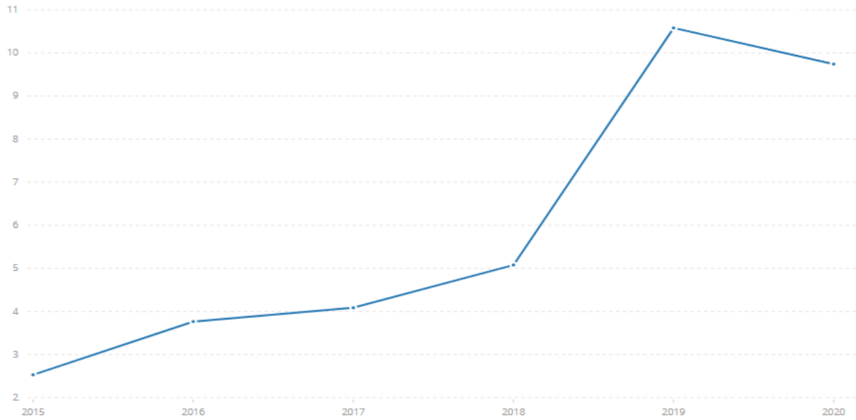
Figure 2 Consumer Price Index of Pakistan in Percentage