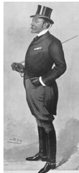
Sir Mortimer Durand in 1903. From a 'Spy'

Threat served as detrimental to Durand line. It is pivotal to record here that while an agreement was reached for locking Durand Line as an Accepted Border between Sub Continent and Afghanistan, there was a lot of hot debate between Britishers and Afghan team. Ultimately Afghans accepted and agreed to allow Exclusive British Control over Dir, Swat, Peshawar, Waziristan and Chitral. In return the Afghans were able to secure some strategic strongpoints like Asmar, Nuristan and some other parts of Afghanistan's eastern regions. A small piece of land in Chitral and Waziristan (Birmal) were left un-demarcated because of partial disagreements. The first demarcation of Durand Line took almost three years and efforts were made to align natural barriers or features supporting border needs. On ground more than dozen villages were cut into halves and many agricultural lands had to be abandoned by locals on both sides of the border. Mohamad Tribe and the Waziri tribes were slightly more effected.