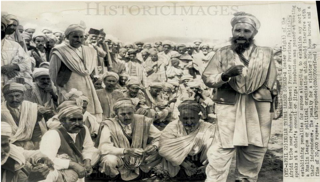
Source : Durandline (n.d). Wikipedia, https://en.wikipedia.org/wiki/Durand_Line

The Uneasy air between Pakistan and Afghanistan during the first decade after the partition of sub-continent was phenomenal and devastating (Yusafzai, 2011). Afghan Pushtoons Officially Demanded (Siddique, 2014) through a letter from Lord Mountbatten to Enjoin Pushtoons Speaking Areas as Separate Entity who diverted the request to incoming successor authority.