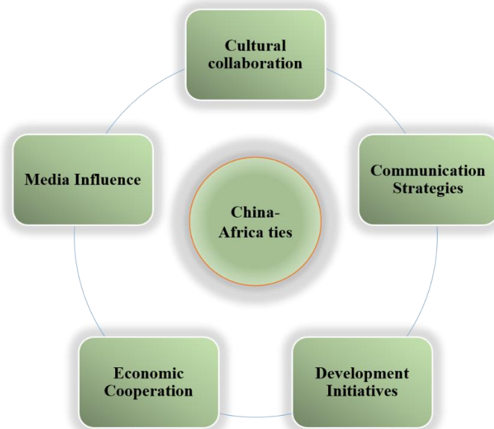
Figure 1. Influential factors of China-Africa ties.

In addition, the diplomatic interactions between China and African nations via mechanisms such as the FOCAC have established a systematic structure for discourse and collaboration (King, 2020; Wekesa, 2013). The policy coordination, project implementation, and joint initiatives across various sectors, including infrastructure, agriculture, healthcare, education, and technology, have been facilitated by regular high-level meetings, ministerial conferences, and strategic partnerships, as noted by Tugendhat and Alemu (2016) and (Aly, 2019). The expanding global influence of China and the vast potential of the African continent have led to a growing interest in the historical setting of China-Africa relations. This context serves as a basis for enhancing and broadening cooperation between the two regions. Chinese and African nations have pledged to strengthen their partnership based on shared interests, reciprocal advantages, and long-standing connections. Through the utilisation of past achievements and endeavours, both parties have the potential to establish a more all-encompassing, enduring, and mutually advantageous partnership that caters to the changing requirements and ambitions of China and Africa. China-Africa relations involve cultural exchange, media dynamics, diplomatic measures, communication strategies and economic cooperation ( Figure 1 ).