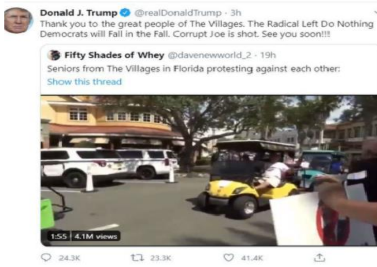
resident Donald Trump retweeted a video Sunday that included a rally supporter at The Villages yelling "white power."